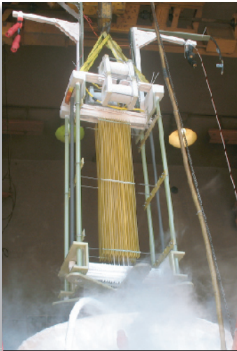
SFCL test module being removed from LN 2 bath after test at KEMA.