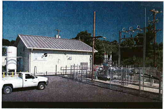
Overall view of the cable termination vessel installation and the Cryogenic Refrigeration System building.

● High initial cost. The initial cost of integrating HTS cable will significantly exceed what an electric utility would typically spend on a conventional underground cable installation. This