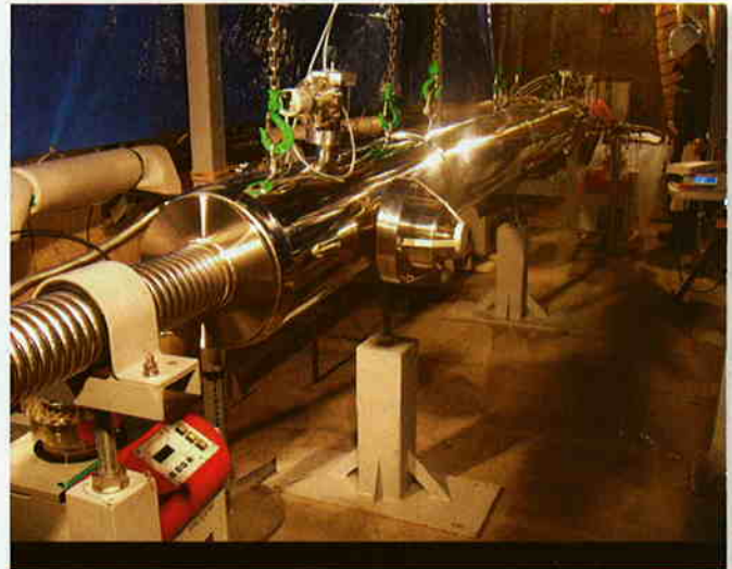
This is the HTS cable-to-cable joint during construction. Future improvements are expected to reduce space requirements for these splices.

The cable will be operated over the next year as part of