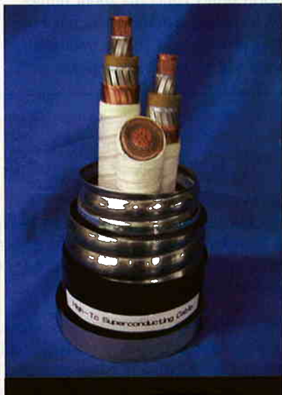
Cut away view of a three-in-one cold dielectric HTS cable.